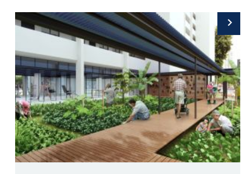
Related Story Lien Foundation leads call for a rethink on spaces and living concepts for seniors